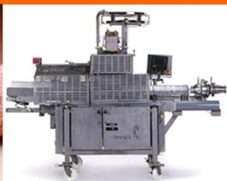
Tipper Tie RS4203